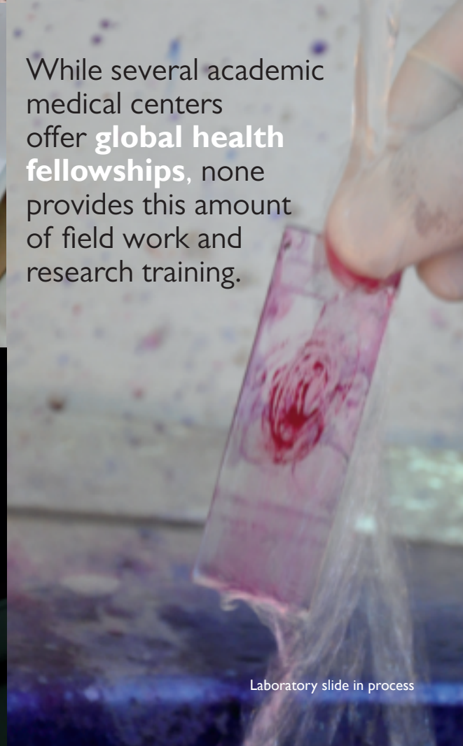
Laboratory slide in process

While several academic medical centers offer global health fellowships , none provides this amount of field work and research training.