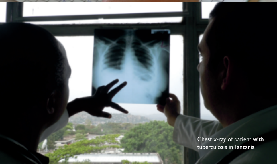
Chest x-ray of patient with tuberculosis in Tanzania